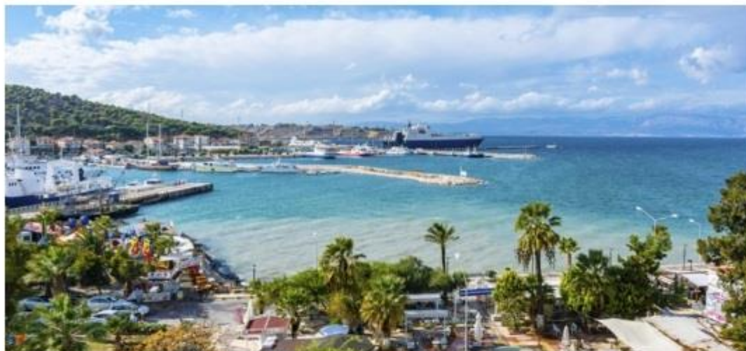
The Part of Çeşme