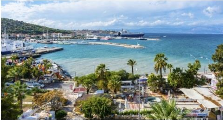
The Port of Çeşme

F erryboat services between the Çeşme district of western Turkey's Izmir province and Greece's coastal town of Lavrion near Athens will commence as of June 2, connecting the Turkish and Greek mainlands for the first time, officials from the company that will arrange the services said Wednesday.